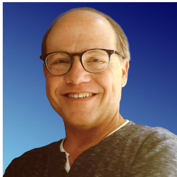
Two Pore Guys

"We characterize our technology as a platform where anybody in diagnostics can make tests for our platform," Heller explained. The assays are sold like apps for smartphones, which leaves it to the assay developer to create a test for a specific target, set pricing and market the test.