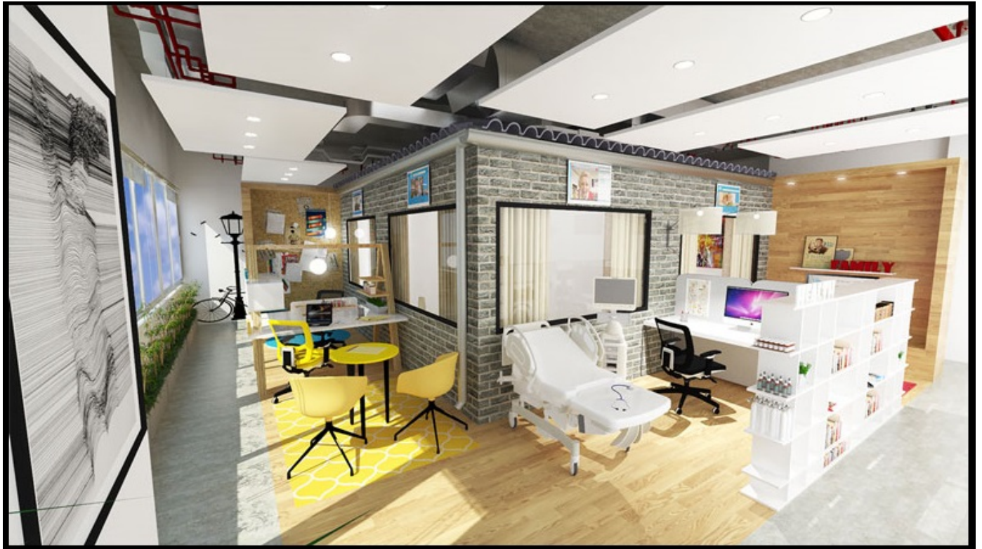
Israel's Center for Digital Innovation (CDI-NEGEV)

"A lot of entrepreneurs make the mistake of falling in love with their gadget, so they invent a solution and then try and find a problem for the solution. We claim otherwise, we say look at the challenge first because there are always many solutions."